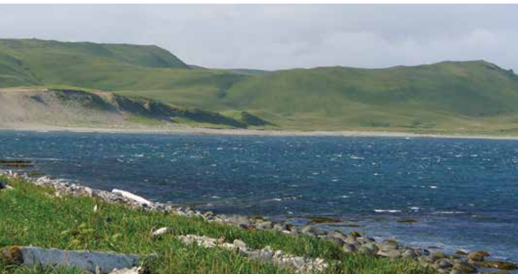
Clues to a history of eight Aleutian tsunamis in the past 2,000 years lie beneath the coastal lowlands of Driftwood Bay on Unimak Island, part of the Fox Islands of Alaska.

From 2010 to 2021, we conducted paleoseismic studies by excavating, describing, and sampling Holocene sediments in coastal environments at 16 sites spanning 1,800 kilometers between the Fox Islands and